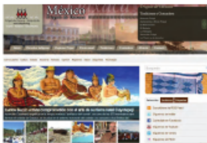
Tribal websites - Mexico & Canada