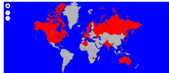
International GreyNet Community, from GreyGuide 2017

Our blog: http://greynetinformationdelivery.blogspot.ca