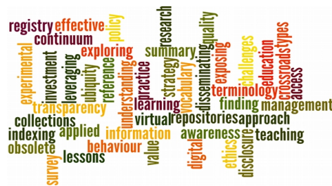
How we Learn, Teach, and Describe Grey Literature

Selected Educational/Promotional Activities - Czech Republic Conference on Grey Literature and Repositories National Repository of Grey Literature