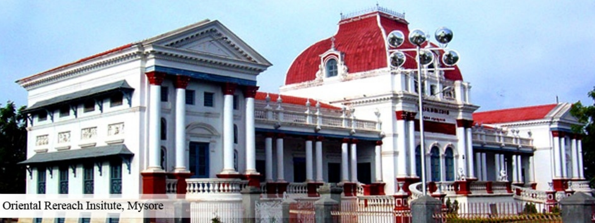
Oriental Rereach Insitute, Mysore