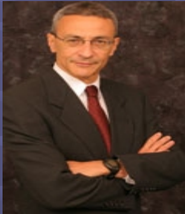
John Podesta, former Chief of Staff in the Clinton White House. Now President and CEO, Center for American Progress